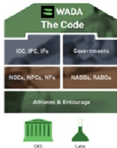
Figure 1. WADA’s depiction of anti-doping work

Reflecting the multiple perspectives on and various strategies for solving the problem of doping in sport, we find that anti-doping efforts draw on the expertise of professionals from many fields and concerned individuals. Using a compound lens forged by integrating the Cynefin framework and CHAT (Hasan, Kazlauskas & Crawford 2010) we describe five strategic activities that have evolved over time and continue to evolve as a means of controlling doping in sport: